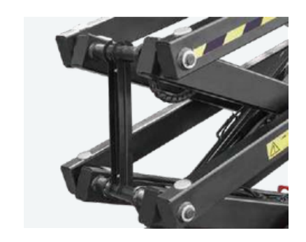
Supporting arms,To protect the operator when he is doing repair or maintenance job