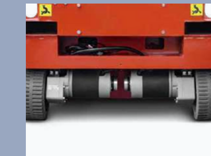
Motor and brake