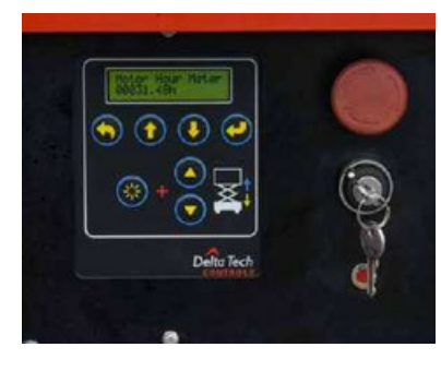
LCD screen, used to display fault code and adjust parameters