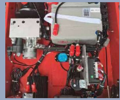
The parts are well located