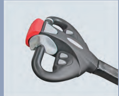
REMA Tiller Head