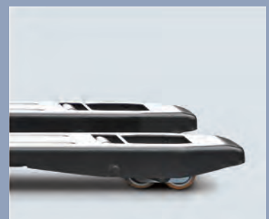
The guiding tips on the ends of the forks make loading and unloading pallets easier.