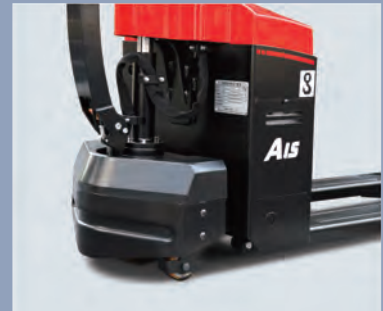
Auxiliary wheels are equipped to give the pallet truck better stability.