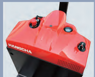
The key switch, emergency cut-off switch, and battery meter are all easily accessible by the operator.